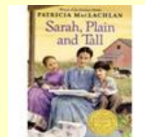
Sarah, Plain and Tall

words and history lessons to connect us to the world of the Native Americans. Sounds exciting, doesn't it? We will accomplish all this and more while being in our heavenly Father's loving care.