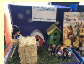
Sarah, Plain and Tall -Diorama