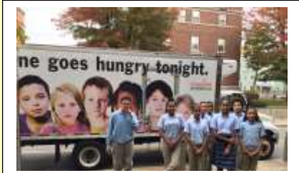
Grade 8 Feinstein Jr. Scholars packing up the truck.