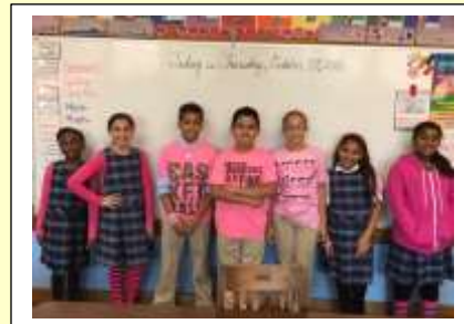
4th grade Feinstein Jr. Scholars supporting breast cancer research.

Dear Families: Please remember to log-on to our FACTS Page to apply for financial aid for the 2017-2018 school year. Priority is given to families who apply on time and verify early!